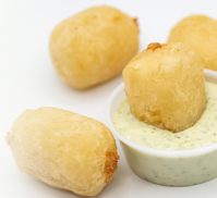
Yucca Cheese Bites